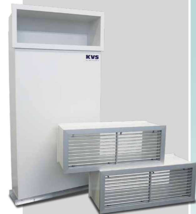
Duct extension and wall ducts with ventilation grilles