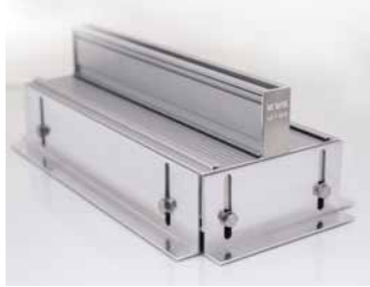
Symmetrical, 1 slot

These particularly variable and versatile floor diffusers are designed for use in indoor swimming pools. The profiles are made of anodised aluminium A6/C0 and offer a shapely and inconspicuous appearance in the room. The aerodynamic shape of the rail distributes air optimally and evenly. An air distribution plate is not required. They are made according to your wishes and measurements. The standard height is 95 - 142 mm..