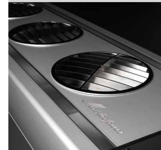
adjustable air outlets

The technical data refer to: hall temperature 30°C / humidity 60 - 80% / pool water temperature 27 - 28°C