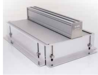
Asymmetrical, 2 slots