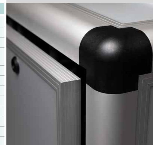
Unit casing made of anodised aluminium with internal insulation and circumferential seal

* The technical data refer to: hall temperature 30°C / humidity 60 - 80% / pool water temperature 27 - 28°C, outside air 8°C / 80%